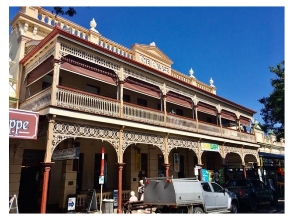
Childers Backpacker Memorial