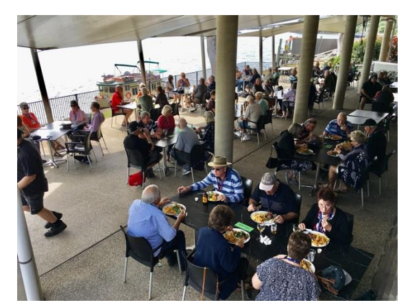
Grunskies Seafood restaurant lunch