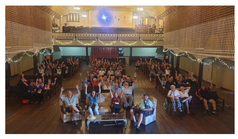
Morning tea and cartoons at Childers Paragon.