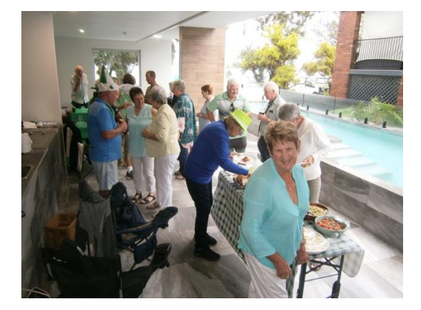
Caloundra St Patrick's Day lunch.