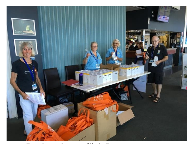
Registration at Club Bargara