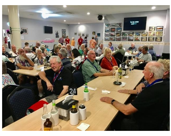
Dinner & dancing at RJ's Rock n Roll