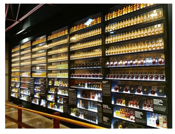
Bundaberg Rum Distillery visit