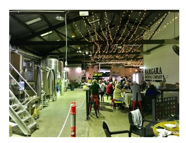
Ballistic Brewery dinner