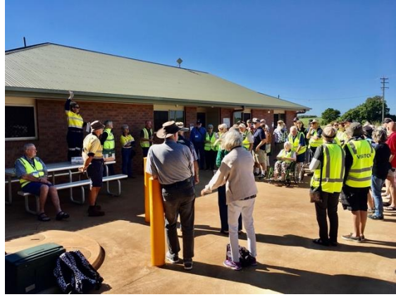
Greensills Sweet Potato Factory Visit