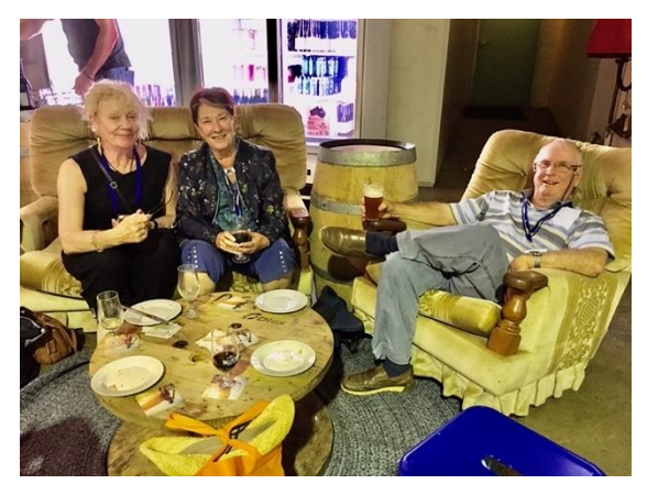
Relaxing after dinner at the Brewhouse